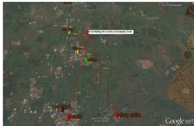
Figure.2. Location of basic amenities from the site

Bus Stop Proximity- Locate the project within 1/4-mile (400-meter) walking distance (measured from a main building entrance) of 1 or more stops for 2 or more public, campus, or private bus lines usable by building occupants.