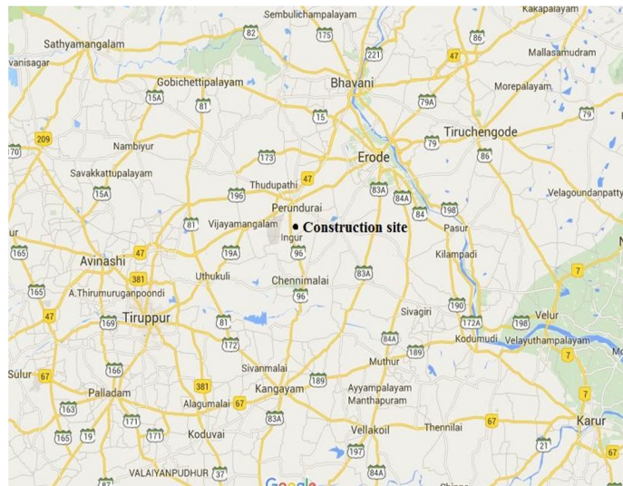
Figure.1. Location of the Construction site

Site selection is the first step to a suitable and a sustainable habitat and thus, needs to be done appropriately, prior to commencement of design phase. Site selection and analysis should be carried out to create living spaces that are in harmony with the local environment. The development of a project should not cause damage to the natural surroundings of the site but, in fact, should try to improve it by restoring its balance. Thus, site selection should be carried out in light of a holistic perspective of land use, development intensity, social well-being, and preservation of the environment.